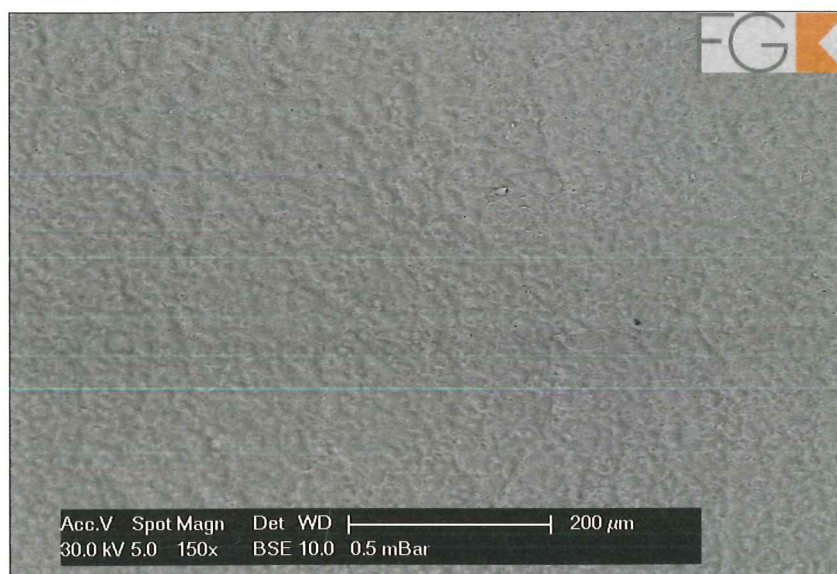
Fig. 3 Sappy structure

When it takes on projects, Kläger assumes complete responsibility along the entire supply chain, from engineering and mold construction to injection molding. The company's long-term experience, its high level of competence and the synergy effects generated from the company's interdisciplinary know-how enable it to complete projects quickly and reliably.